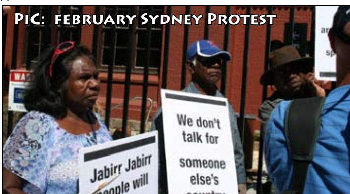
PIC: FEBRUARY SYDNEY PROTEST