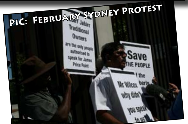
PIC: FEBRUARY SYDNEY PROTEST

“We see that by being at the table Traditional Owners can negotiate for high standards of protection for our cultural and environmental values, whilst also improving education, employment and life opportunities.”