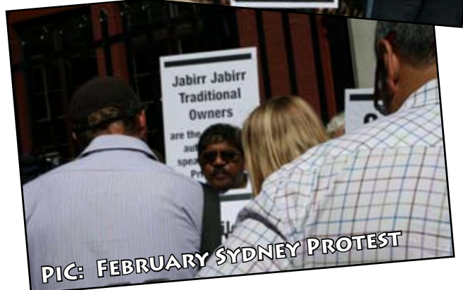
PIC: FEBRUARY SYDNEY PROTEST