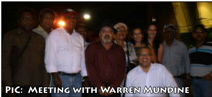
PIC: MEETING WITH WARREN MUNDINE