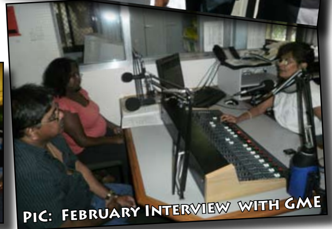
PIC: FEBRUARY INTERVIEW WITH GME